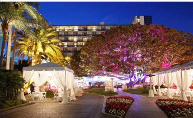
The Bungalow at the Fairmont Santa Monica