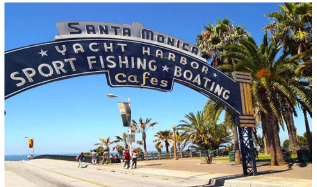
Santa Monica Pier