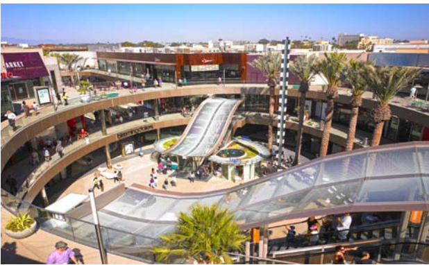
Santa Monica Place