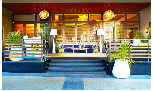
Le Meridien Delfina Santa Monica