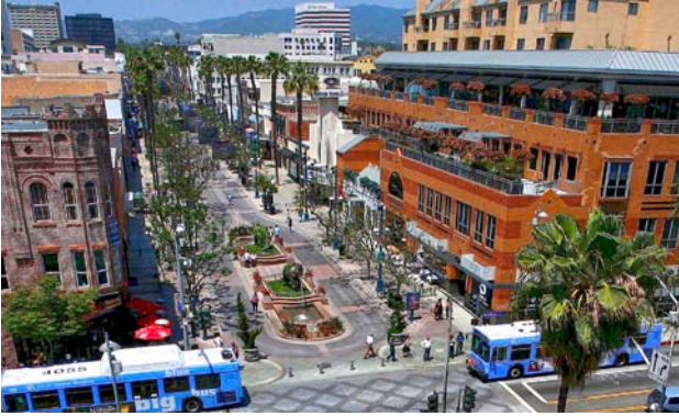
Third Street Promenade