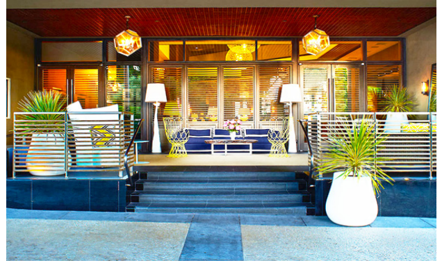
Le Meridien Delfina Santa Monica