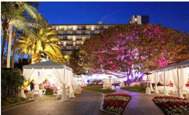
The Bungalow at the Fairmont Santa Monica