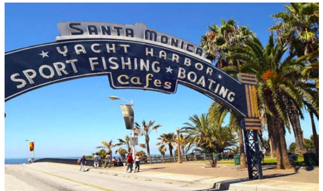
Santa Monica Pier