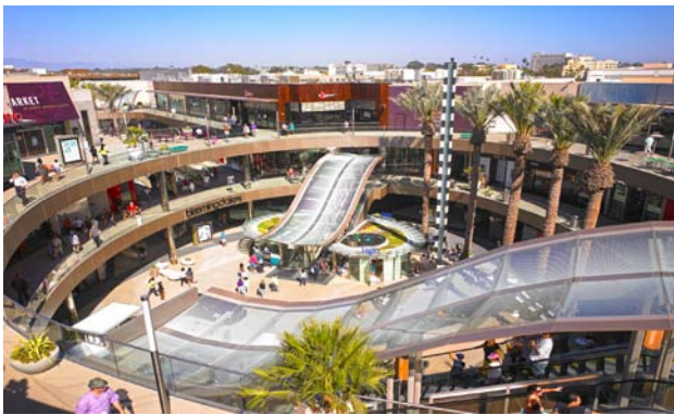
Santa Monica Place