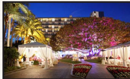
The Bungalow at the Fairmont Santa Monica