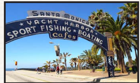
Santa Monica Pier