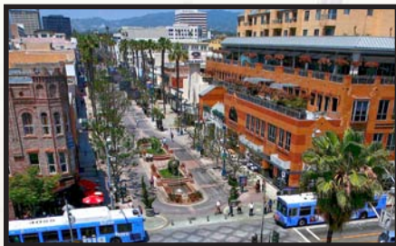
Third Street Promenade