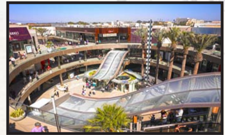
Santa Monica Place