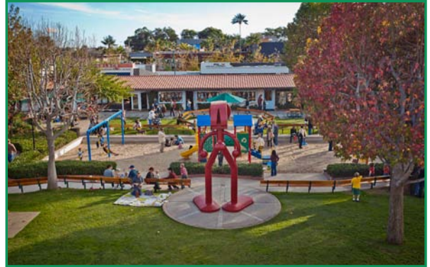
Malibu Country Mart