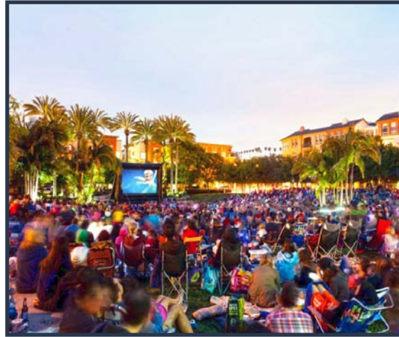
MOVIES IN THE PARK