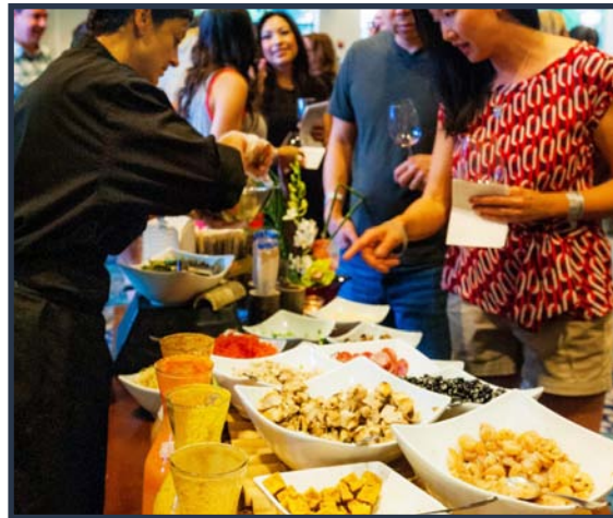
TASTE OF PLAYA VISTA