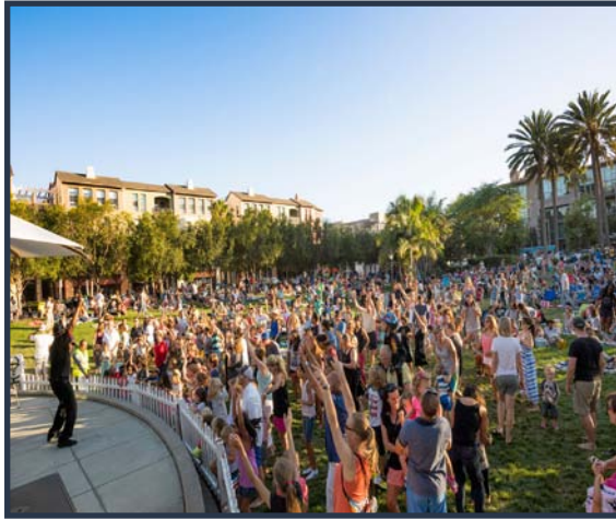
CONCERTS IN THE PARK