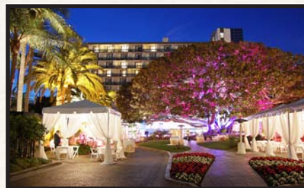
The Bungalow at the Fairmont Santa Monica