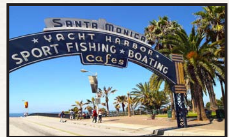
Santa Monica Pier