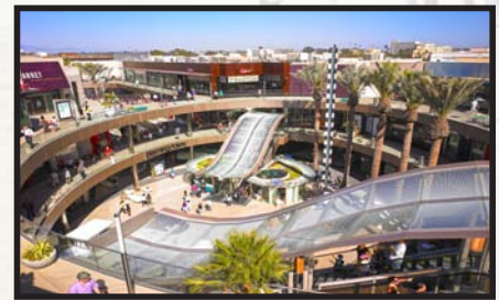
Santa Monica Place