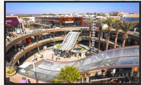
Santa Monica Place