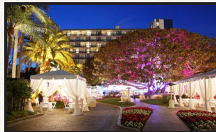
The Bungalow at the Fairmont Santa Monica