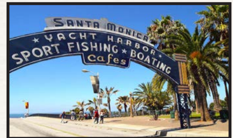
Santa Monica Pier